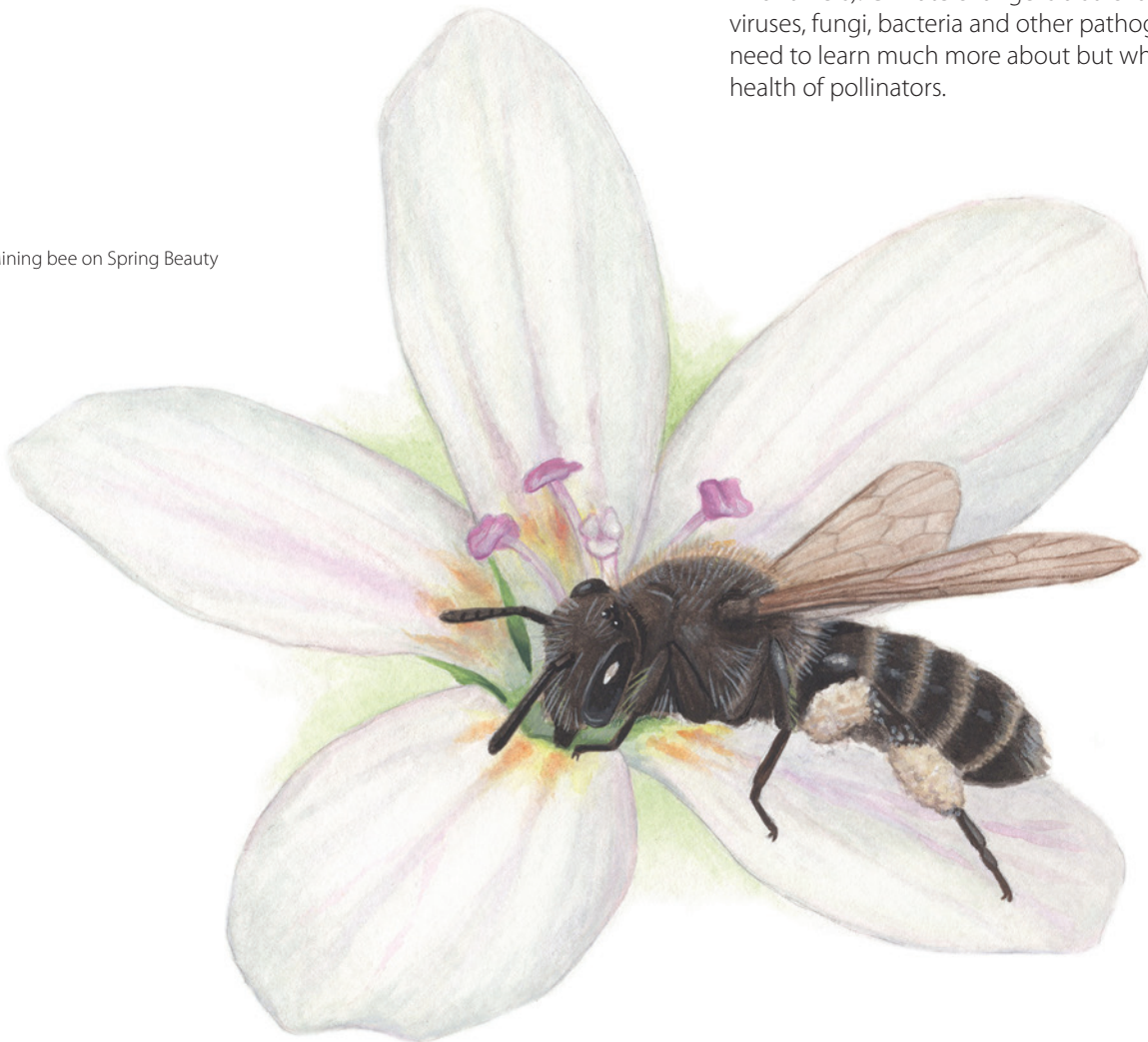
Mining bee on Spring Beauty

Climate change can also facilitate the spread of invasive species, which can negatively impact pollinators. These invasive species can include other insects, which may compete for forage or nesting resources, animal species, which may be predators of pollinators, and plant species, which may outcompete important food sources (e.g. garlic mustard competing with native wildflowers). Climate change is also changing microbiota like viruses, fungi, bacteria and other pathogens in ways we still need to learn much more about but which pose risks to the health of pollinators.