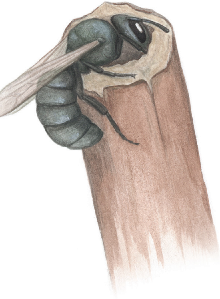
Ceratina with raspberry cane

While most of us are familiar with the European Honeybee, a managed species used for pollination of large-scale agriculture and honey production, we also have 855 described species of native bees in Canada, with more still likely to be described. Southern Ontario has over 350 different bee species, the majority of which are solitary (not living in hives) and ground-dwellers. An additional third of our native bees live in cavities like the pithy stems of last year's raspberry canes (image of ceratina with raspberry) or holes in the mortar between bricks. People are often surprised to find out we have so many types of bees. In fact, Ontario's bees come in many different colours, including metallic silver, green, blue, red, and the more typical black and yellow. Some are very fuzzy but many aren't.